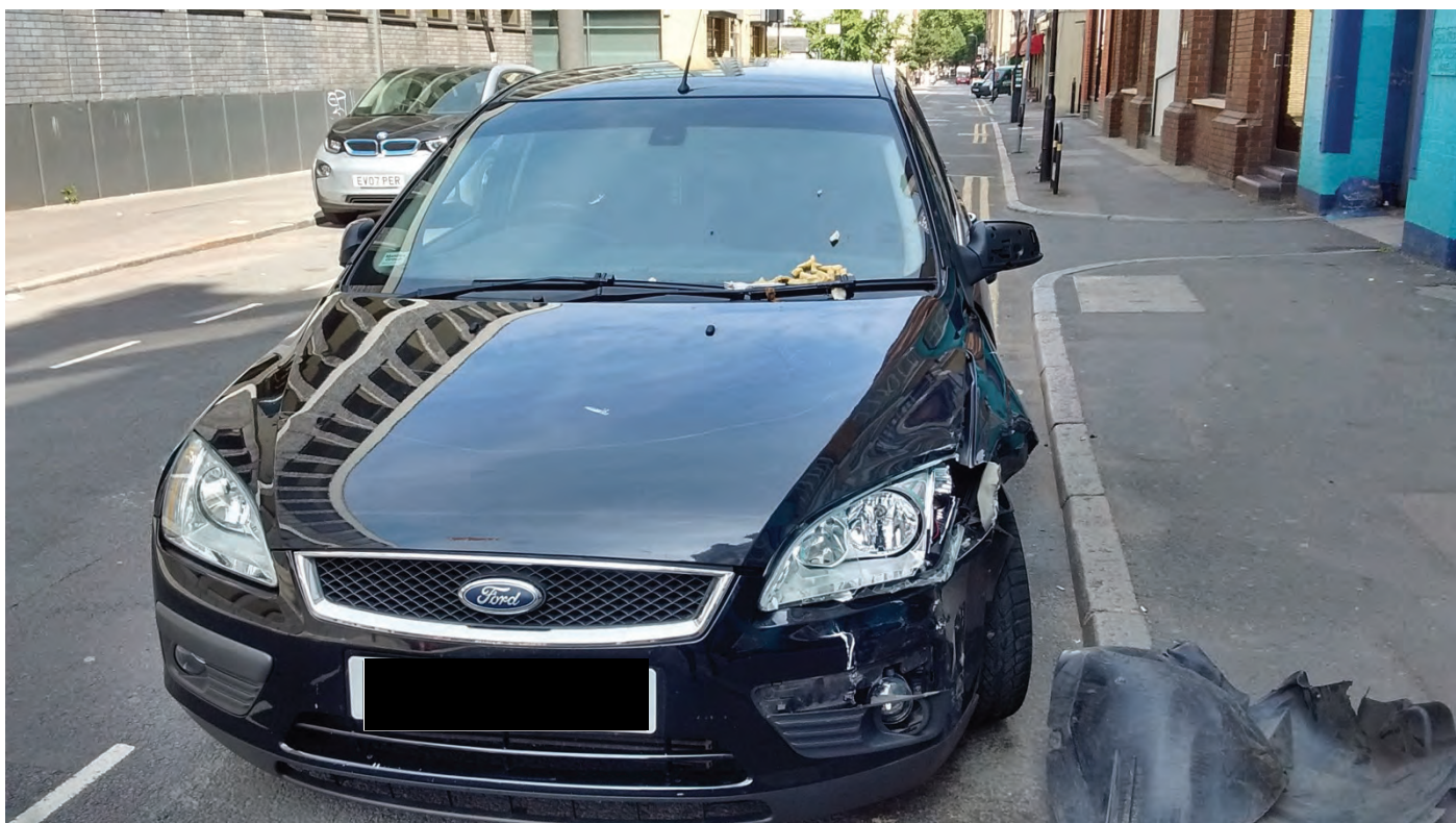
Photos of car damage 26 August 2017, Paul St EC2